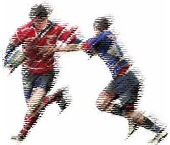
Waiting for the grass to grow